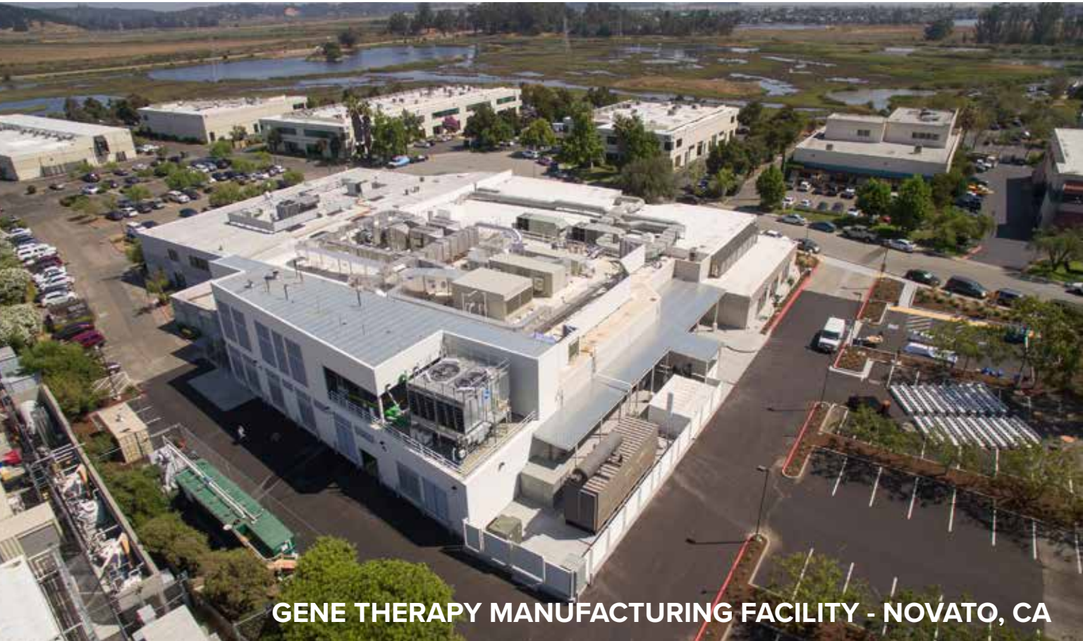
GENE THERAPY MANUFACTURING FACILITY - NOVATO, CA